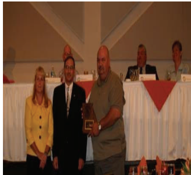
Jail Administrator of the Year Award,